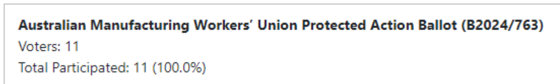
Diagram 1: Final Vote Participation

Final Ballot Audit: Friday, 28 June 2024 at 12.05pm AWST