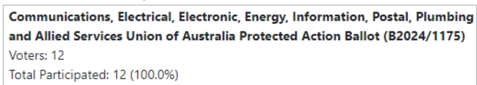
Diagram 1: Final Vote Participation

Final Ballot Audit: Wednesday, 25 September 2024 at 2.05pm AWST