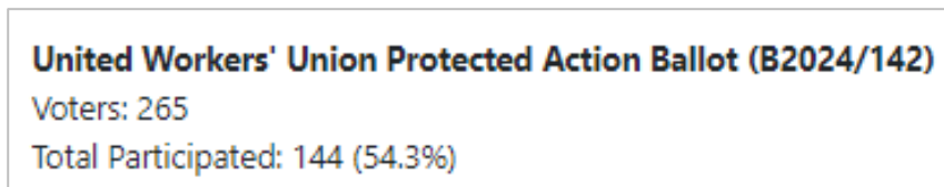
Diagram 1: Final Vote Participation

Final Ballot Audit: Wednesday, 6 March 2024 at 1.05pm AWST