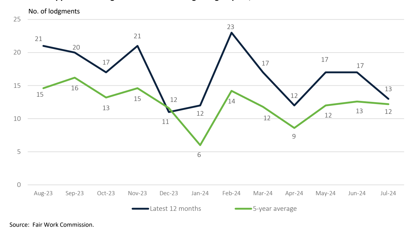
Chart 2.5: Applications lodged to deal with a bargaining dispute, s.240