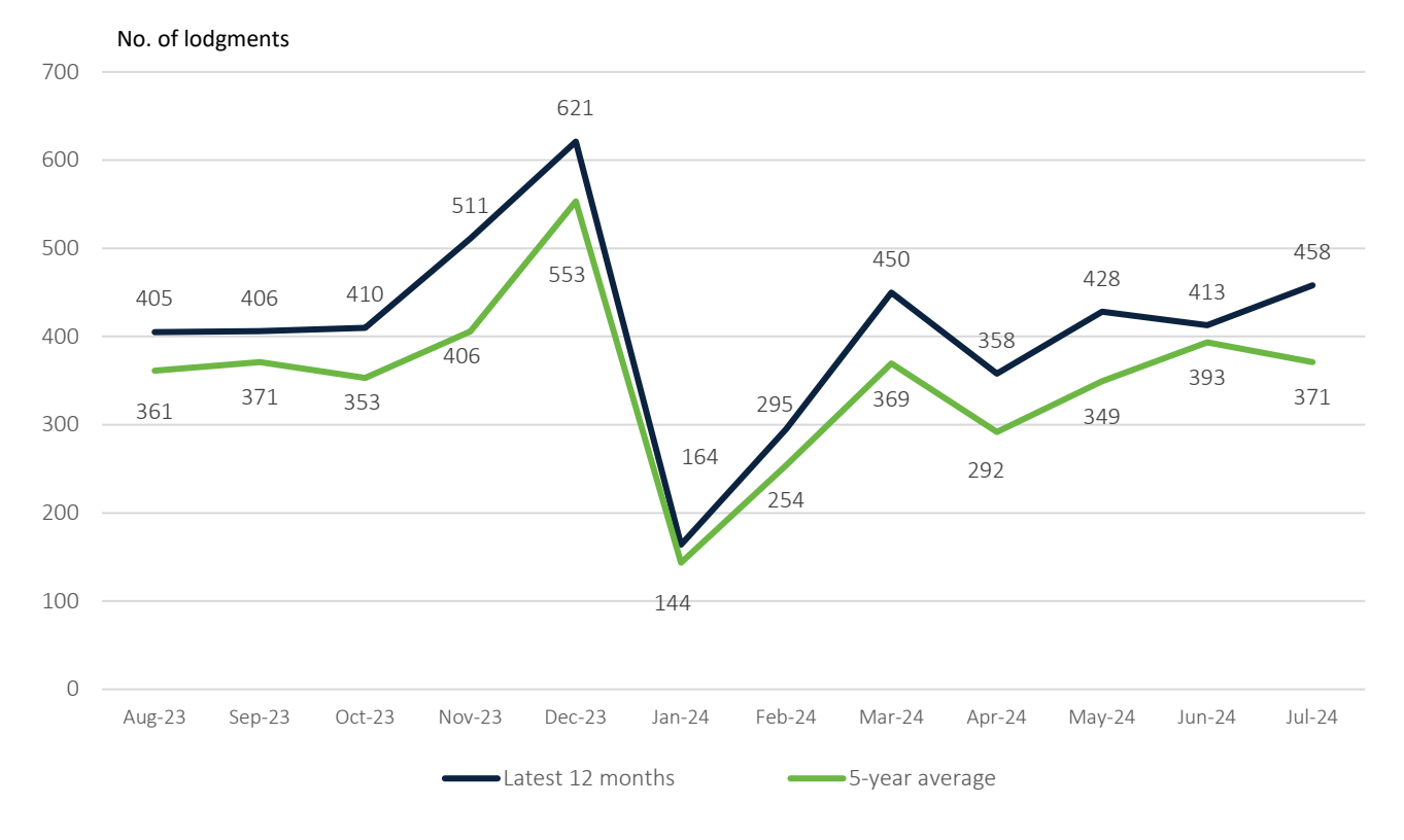
Chart 2.1: Number of agreement approval applications lodged, s.185

Note: This data series contains applications subsequently withdrawn or converted (varied) by the applicant. See Data Definitions for further information.