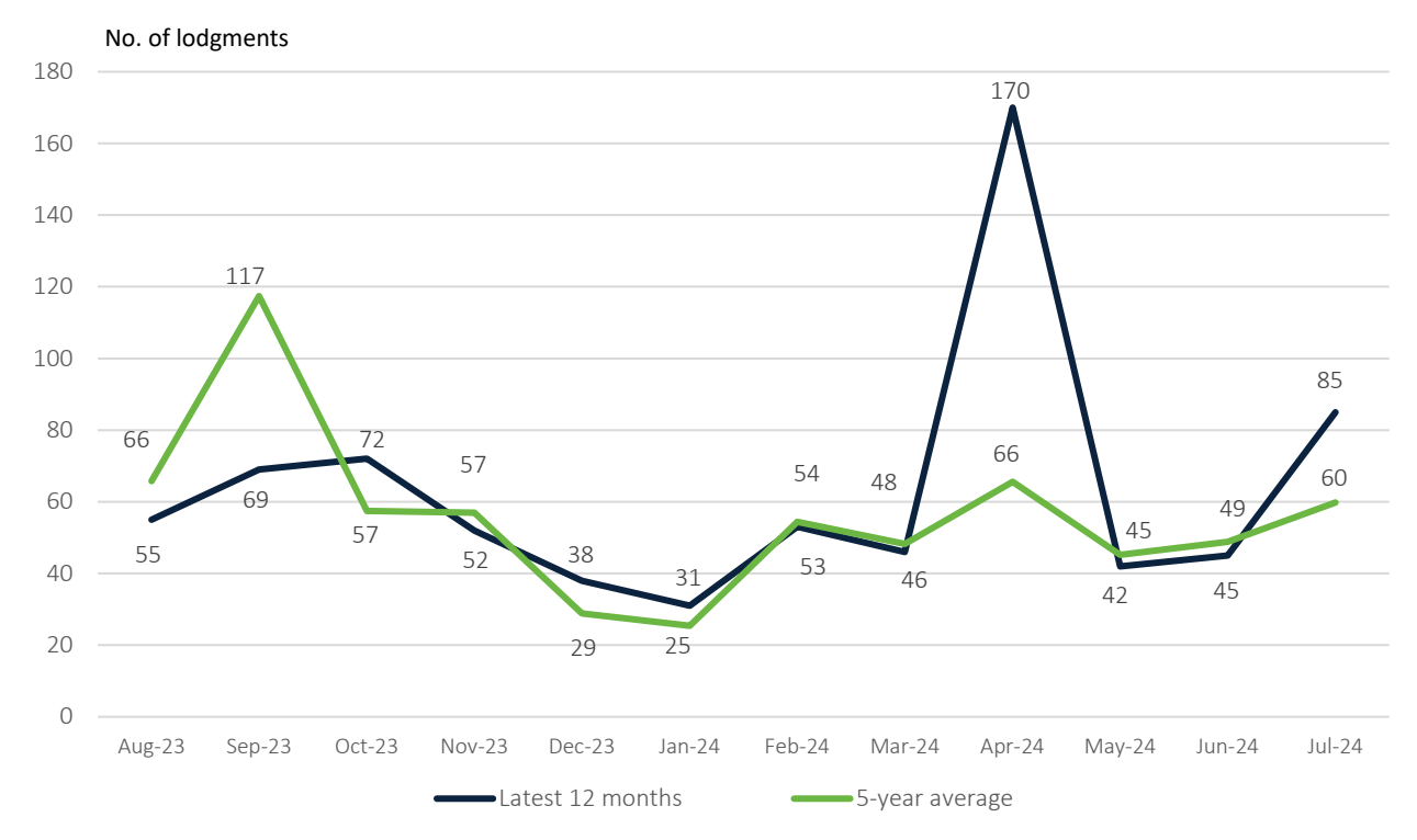
Chart 2.2: Applications lodged for protected action ballot orders, s.437