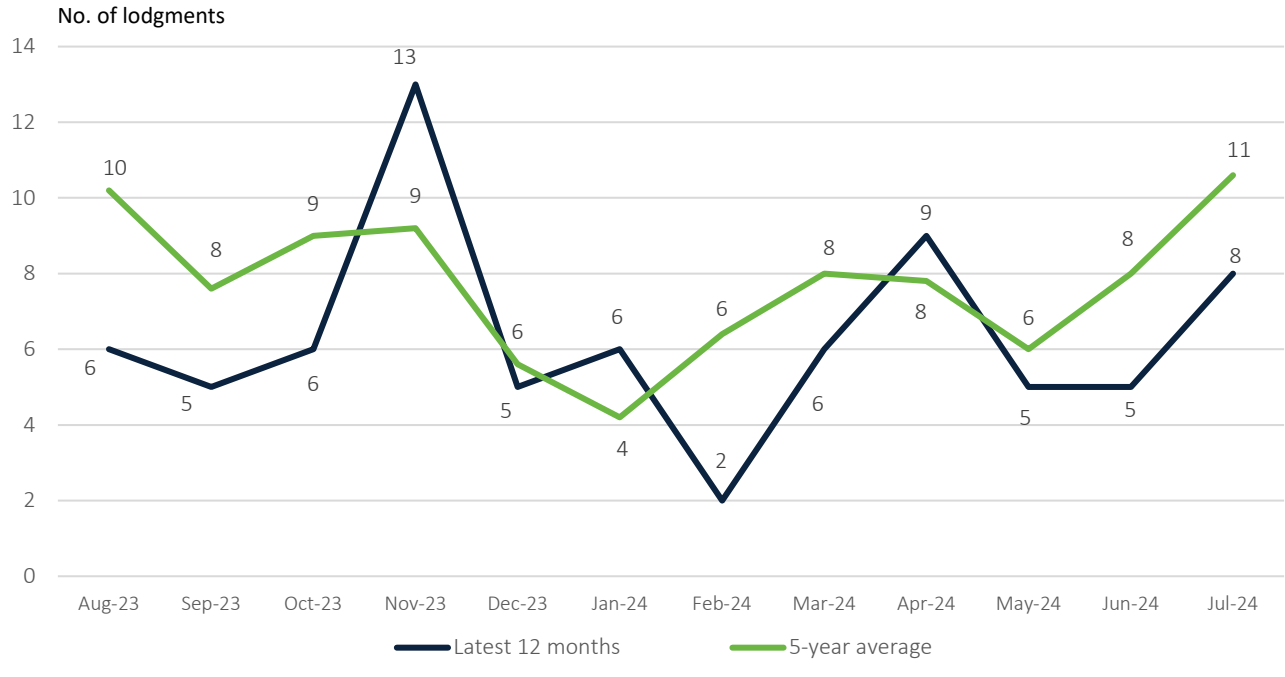
Chart 2.3: Applications lodged for majority support determination, s.236