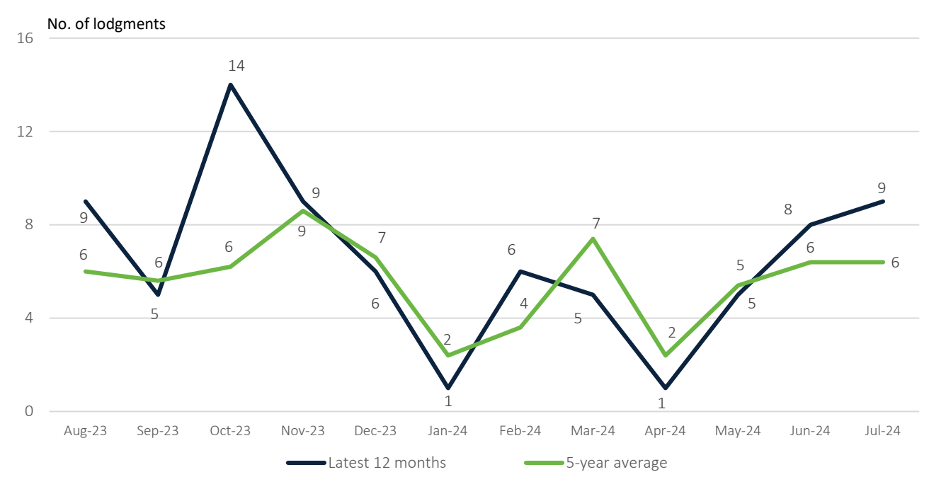
Chart 2.4: Applications lodged for a bargaining order, s.229